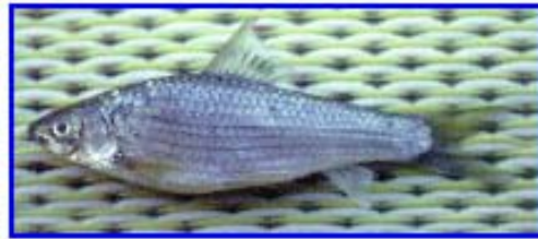
picture (Helin_u0.jpg)