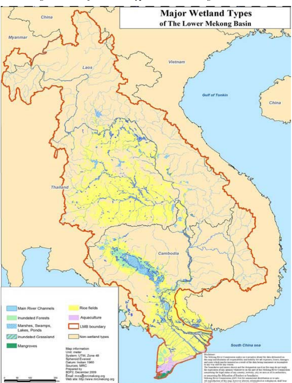
Figure A1.2: Major Wetland Types in Lower Mekong Basin