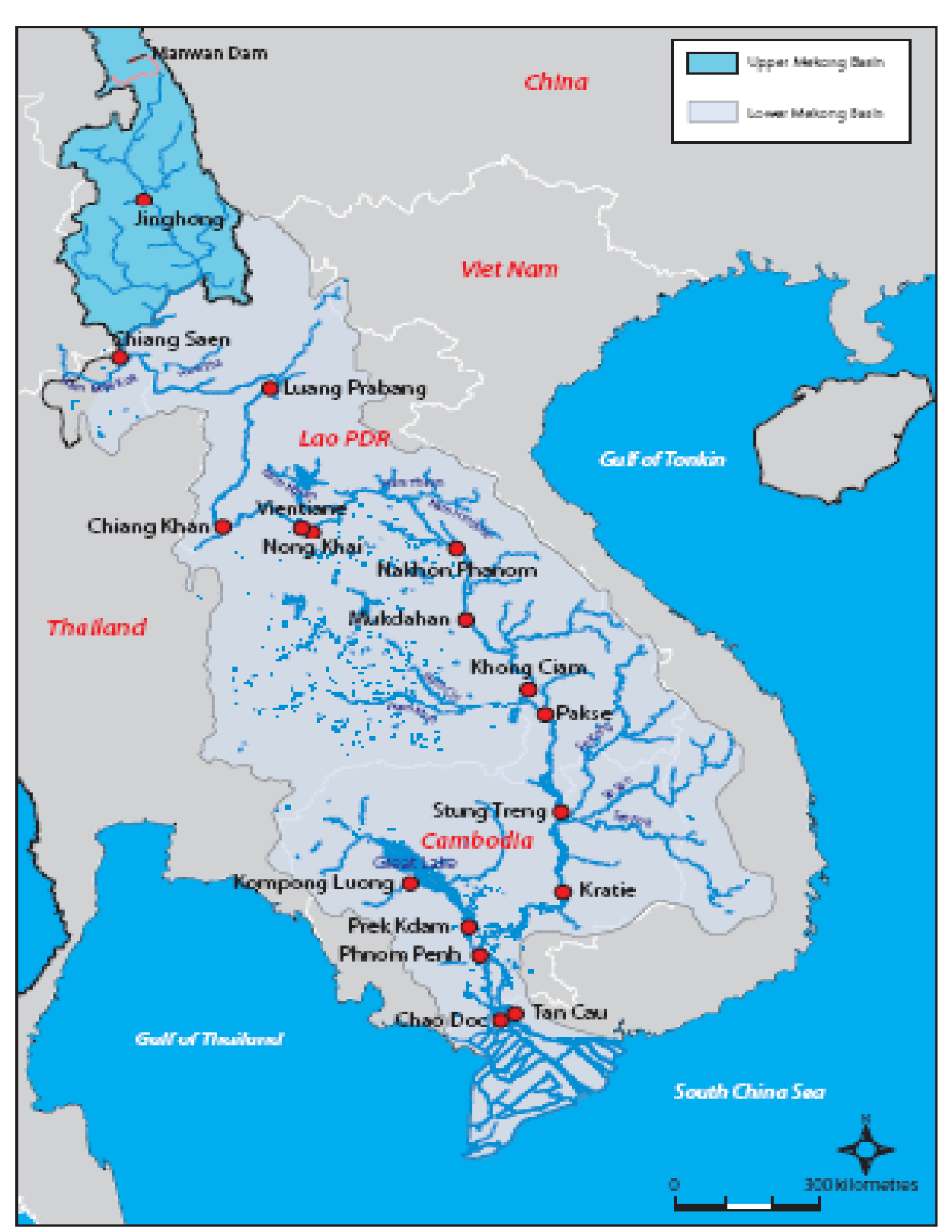
Figure A1.1 : Major Mekong Mainstream Gauging Stations